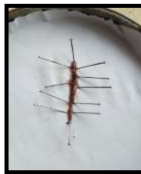
Table:1 Bacterial colony characterization.

Each specimen to be dissected was washed with sterile distilled water and surface sterilized using 95% ethanol. The specimen was placed on the wax dissecting tray and was fixed longitudinally using sterile dissecting pins, one mounting the mouth and other the anus. The fine edge of a flamed pair of dissecting scissors was inserted into the ventral surface at the mouth region and the incision was made longitudinally along the earthworm till the anus. Sterile dissecting pins were used to hold down the earthworm on the board, stretching out the body wall to expose the internal structures.