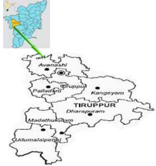
Fig. 1. The map showing study area of Tirupur district.

Tirupur is located at 11.1075°N 77.3398°E. It has an average elevation of 295 metres (967 feet). Tirupur is situated at the banks of Noyyal River, helping the textile business to grow well. As a textile city Tirupur is full of Dyings and Garments. Its location as a center of other cities like Erode, Coimbatore makes it easier to get cotton and other stuffs for the business to be done. The Noyval River runs through the city and forms the southern boundary of corporation. The cities fast development leads to growth to its status as Tirupur district (Figure-1). The southern part of the city enjoys more rainfall Due to the surrounding of Western Ghats of the city. The mean maximum and minimum temperatures for Tirupur city during summer and winter vary between 35 to 22 °C (95 to 72 °F). The alternative perspective of historical geography is used to understand how Tirupur's industry is an outcome of processes liking work and investment across sectors in a form of regional industrialization based on small town.