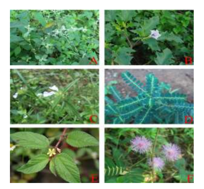
Fig. 2. Showing the common herb plants collected in Noyal river bed. A- Aerva lanata, B- Datura stromonium, C- Leucas aspera, D- Phyllanths amarus, E- Corchorus aestuans, F- Mimosa pudica