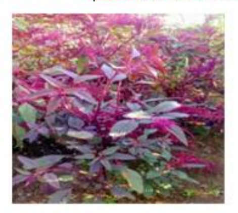
1. Amazanthus cruentus L.

PLATE I: SELECTED GREEN LEAFY VEGETABLES