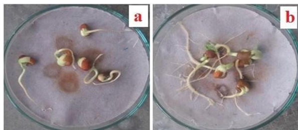
Fig. 4. (a) Reference samples, (b) K-doped ferric sulphide treated samples

From the Table.1, it is clearly shows that the shoot length, root length, leaf length and number of leaves are differing from the reference sample (Fig. 4.a). On the other hand, observed seed growth is much more in nanoparticle treated samples (Fig. 4.b).