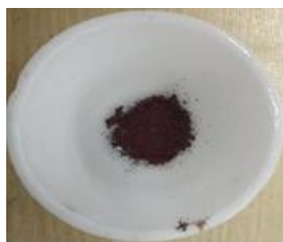
Fig. 1. As prepared Potassium doped Ferric sulphide nanoparticles

The characterization of nanoparticles was analyzed by using X-ray diffraction (XRD) and field emission scanning electron microscopy (FESEM).