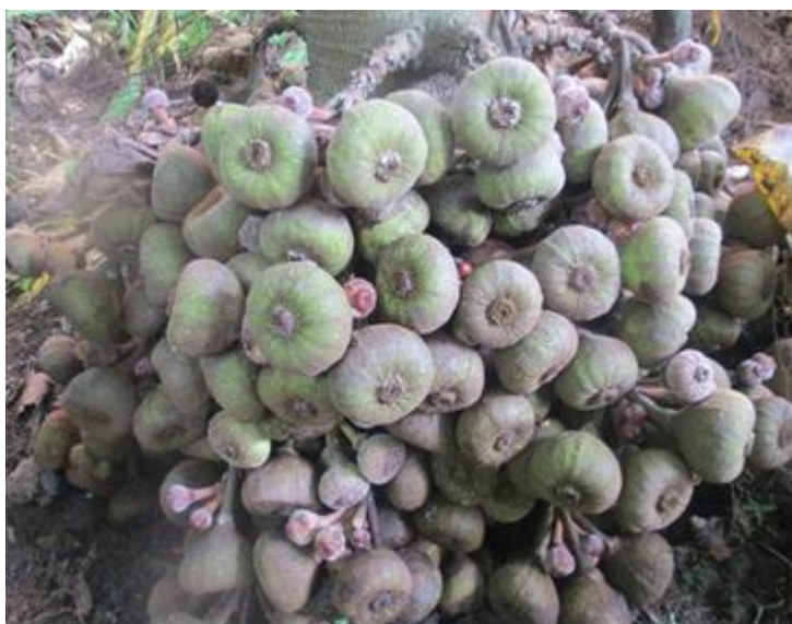
Figure 1. Ficus auriculata Lour - Fruit