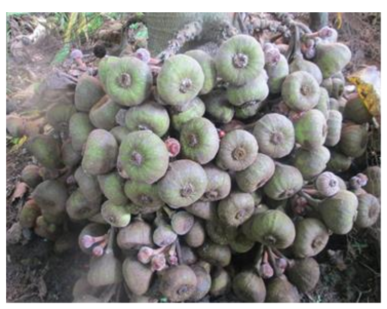
Figure 1. Ficus auriculata Lour - Fruit