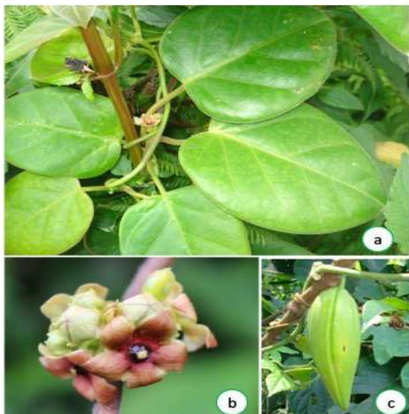
Fig. 1. Habit of Vincetoxicum subramanii a) Flowering twig, b) Inflorescence, c) Folicle fruit

Flower: Monoecious, Flowers in axillary or lateral, umbellate cymes;